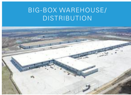
BIG-BOX WAREHOUSE/ DISTRIBUTION